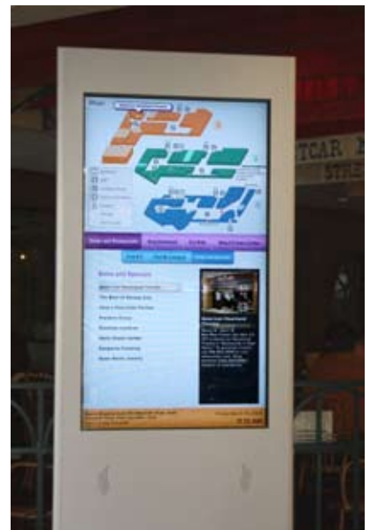
With an interactive kiosk, customers can display directions to a chosen store or venue from the kiosk location with just a touch.

Even though Crown Center's kiosks have been up only for a relatively short time and the metrics are still being analyzed, the kiosks have proven to be a valuable tool for the campus and tenants. "We've been pleasantly