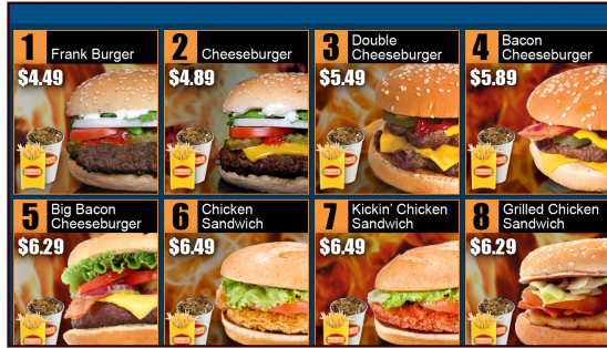
Combo Menu with Dynamic prices